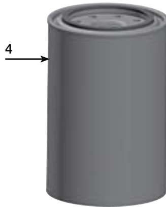
S3230P Filter sold separately. Only Item parts 1-3 are included in the RK12963.