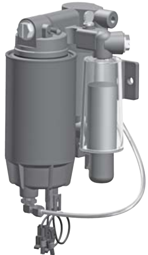
Integrated Assembly (not the RK12963)